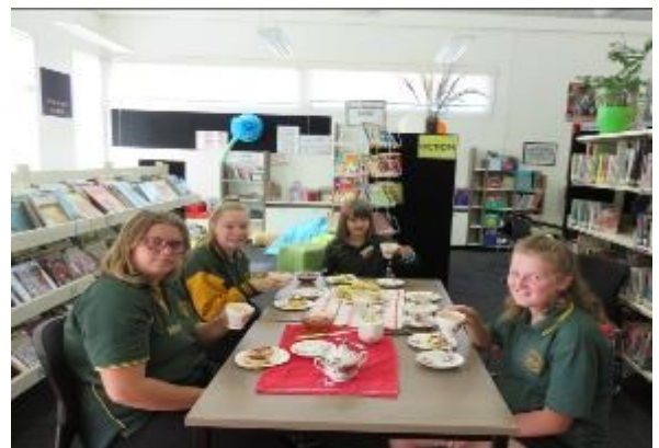
Enjoying a cup of tea at book club

Happy holidays to you all Isabella SSO Resource Centre